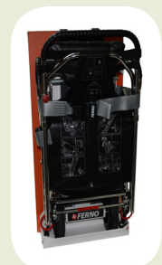
2-Piece In-Vehicle Storage Bracket for chair & track

Part Nos: 071481450 Compact 2 Track Chair 009103800 Compact 2 Track In-Vehicle Storage Bracket for chair & track