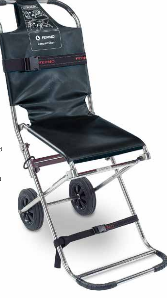
Compact 1 proven chair is invaluable when transferring patients through corridors and lifts due to it's narrow design and large rear wheels.