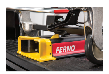
A simple, single-hand release unlocks the cot from the Stat Trac