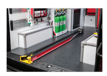
Straight in-track design eliminates the need to steer the cot when loading and unloading